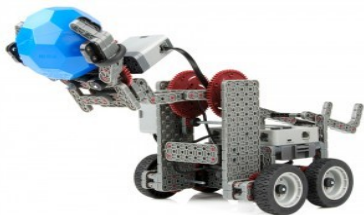
VEX IQ Robot

The robotics camp will introduce and prepare youth in grades 3-7 for a VEX IQ Robotics competition to be held on the final day of camp. Students will learn how to design, build, and program a robot. Participants will also learn to participate in teamwork activities and will view demonstrations of various robotics applications.